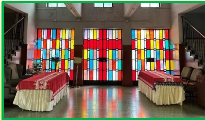
三扇彩色門，中門鑲嵌紅色十字架圖案 Triple portal entrance with coloured panes displaying a red cross in the middle