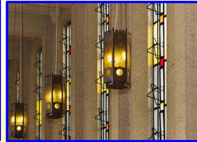
粗灰泥批盪牆身、彩色窗及裝飾吊燈 Walls with roughcast plaster, colourful window panes and ornamental lanterns