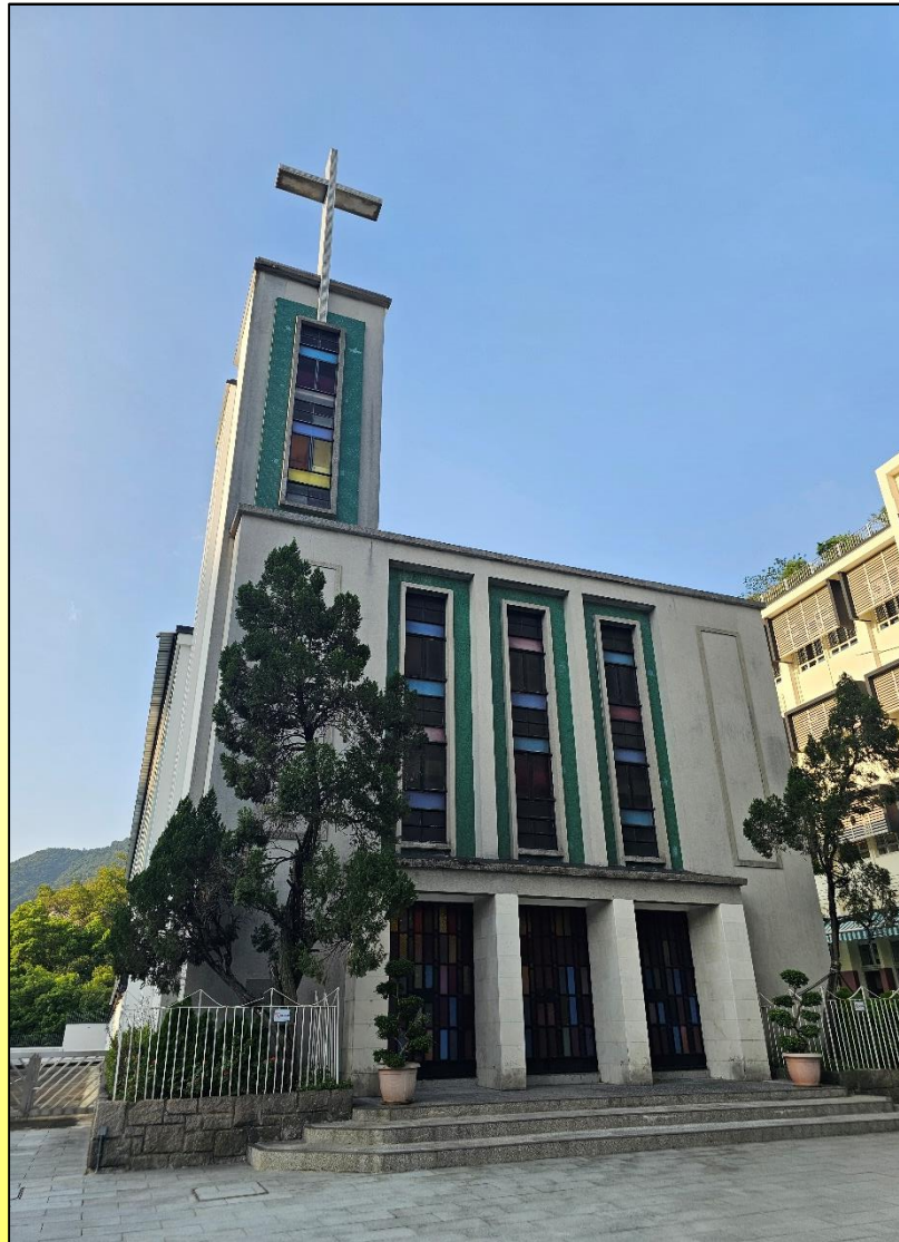
正立面 Front elevation 2026