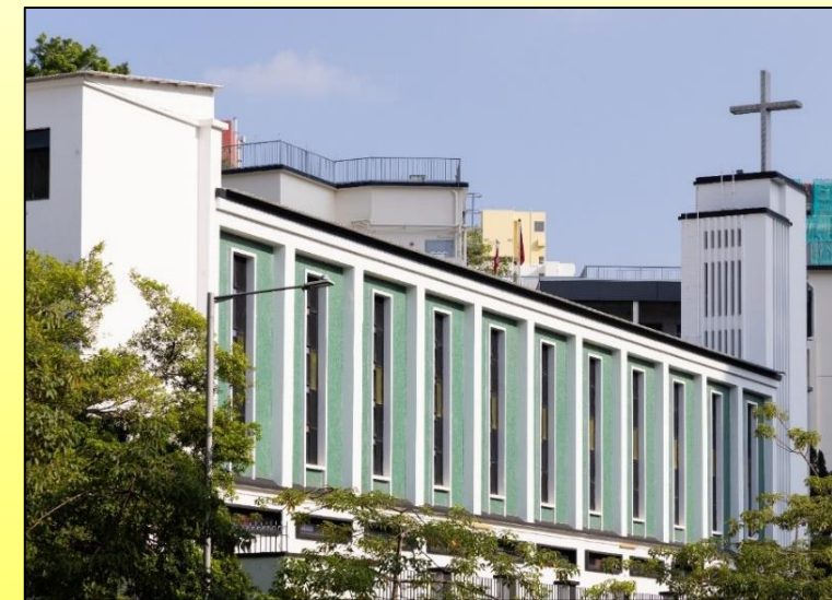
西北（上）及東南（下）側立面 North-west (above) and south-east (below) side elevations 2026